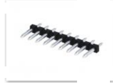
Male PCB Terminal block 3.50mm Pitch KLS2-333J-3.50