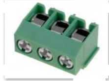
PCB Terminal block 5.0mm Pitch KLS2-126-5.00