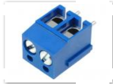
PCB Terminal block 5.0mm Pitch KLS2-300-5.00