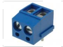
PCB Terminal block 5.0mm Pitch Right Angle KLS2-300R-5.00