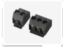
Female Terminal block 5.00mm Pitch KLS2-331KB-5.00