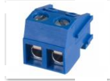
Female Terminal block 5.0mm Pitch KLS2-332K-5.00