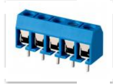
PCB Terminal block 5.0mm Pitch KLS2-306V-5.00