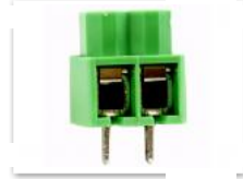
PCB Terminal block 7.50mm Pitch KLS2-166-7.50