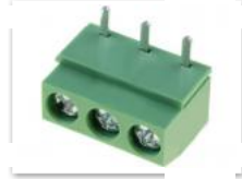
PCB Terminal block 5.0mm Pitch Right Angle KLS2-126R-5.00