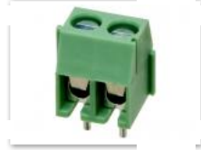
PCB Terminal block 3.50mm & 3.96mm Pitch KLS2-350-3.50 & 3.96