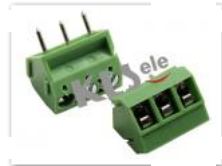
PCB Terminal block 5.0mm Pitch KLS2-104-5.00