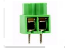
PCB Terminal block 5.0mm Pitch KLS2-166-5.00