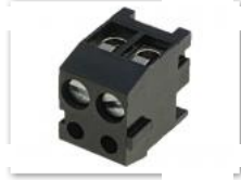
Female Terminal block 3.50mm Pitch KLS2-333K-3.50