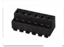
Female Terminal block 5.0mm Pitch KLS2-331K-5.00