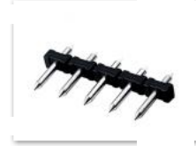
Male PCB Terminal block 5.0mm Pitch KLS2-332J-5.00