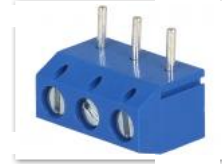
PCB Terminal block 5.0mm Pitch Right Angle KLS2-301R-5.00