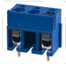
PCB Terminal block 10.0mm Pitch KLS2-300-10.0