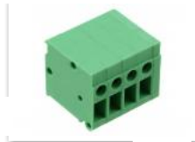
PCB Terminal block 5.0mm Pitch Right Angle KLS2-147R-5.00