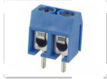
PCB Terminal block 5.0mm Pitch KLS2-301-5.00