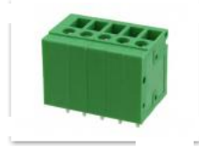
PCB Terminal block 5.0mm Pitch KLS2-146V-5.00