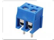
CONN TERM BLK VERT 3.81mm PCB KLS2-340-3.81