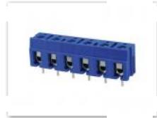
PCB Terminal block 7.5mm Pitch KLS2-300-7.50