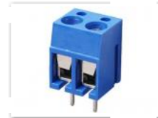
PCB Terminal block 5.0mm Pitch KLS2-305V-5.00