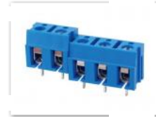
PCB Terminal block 7.5mm Pitch KLS2-305V-7.50