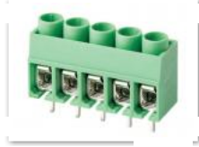
PCB Terminal block 5.0mm Pitch KLS2-168-5.00