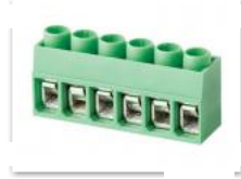
PCB Terminal block 5.0mm Pitch Right Angle KLS2-168R-5.00