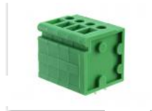
PCB Terminal block 5.0mm Pitch KLS2-147V-5.00