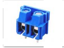
PCB Terminal block 7.5mm Pitch KLS2-360-7.50