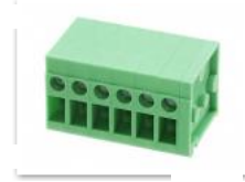
PCB Terminal block 5.0mm Pitch Right Angle KLS2-146R-5.00